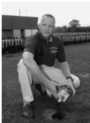
Dukes with data logger used to record soil-moisture data from the turf grass research plots.

Currently, the cost of available soil-moisture sensor-based controllers ranges from $75 to $350. In areas where the cost of water is relatively high, the devices could pay for themselves in a year or less as a result of water savings. As Florida's population and accompanying residential communities continue to expand, there will be an even greater drain on existing freshwater supplies. Soil moisture sensors are an inexpensive and effective way to conserve this important resource.