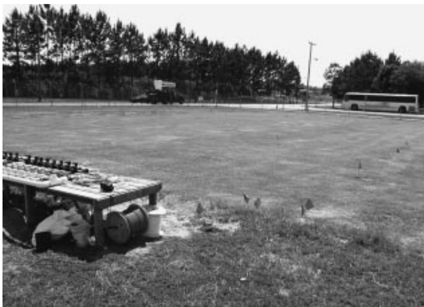
Soil-moisture sensor research plots during establishment at the University of Florida, Gainesville.

and 10 a.m. The one and two days per week watering frequencies represent typical watering frequencies when watering restrictions are imposed in Florida. The soil-moisture sensors are being compared to a time-based irrigation schedule with a rain sensor (similar to what a homeowner would use) that is set based on historical evapotranspiration (ET), a time-based treatment with a rain sensor, that is 60 percent of historical ET, and a historical ET-based irrigation schedule without a rain sensor.